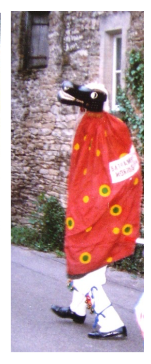
The Red Horse after 1999 with the new (longer) skirt