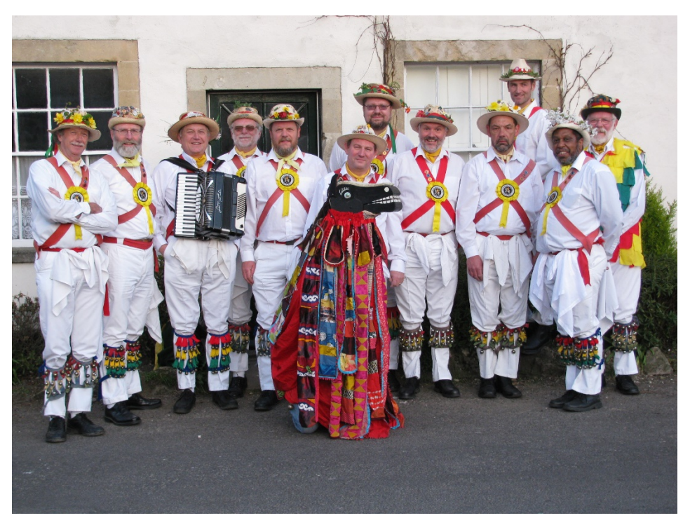
The Green Horse in Nunney 2013.