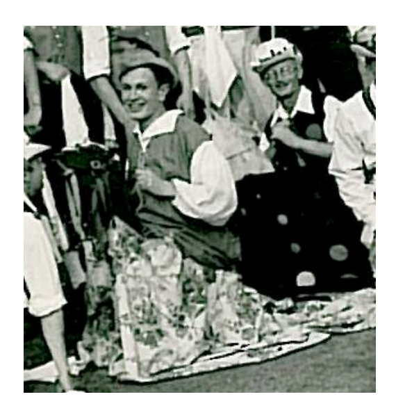
In July 1959 the Horse went to the Exeter Ring Meeting