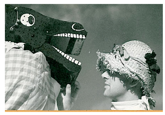
Performances in Gloucester and Marshfield.